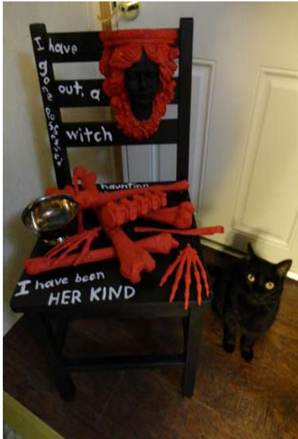
Anne Sexton Poet Chair

In various places in the museum you will find Poetry Chairs—chairs inspired by poems and poets. A few can be sat on—all are for viewing and reading.