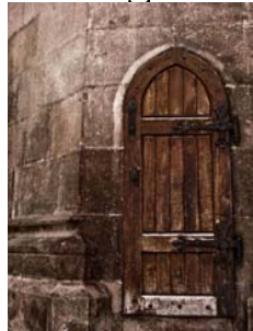
Exhibit 5 Doors

Doors and doorways are significant in poetry . . . And they have rich meaning in our lives. All kinds of doors. All kinds of meanings. Enjoy these doors and the poetry inspired by and about doors and doorways.